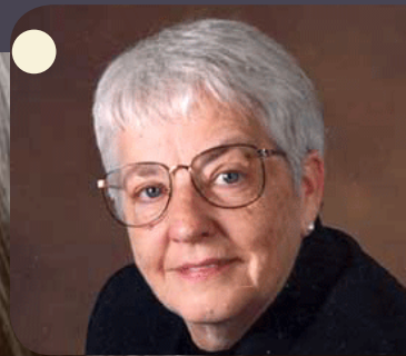
Featuring Jane Elliott Beyond Brown Eyes Blue Eyes